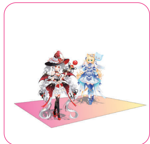
Exhibitor Bare Space Outlook