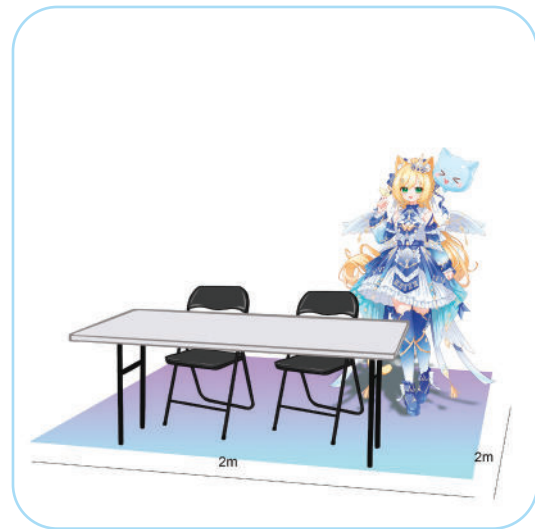
Artist Alley Table Outlook