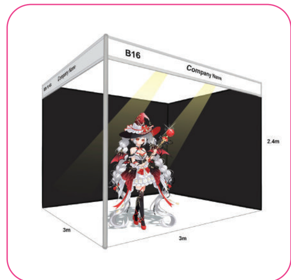
Exhibitor Booth Outlook